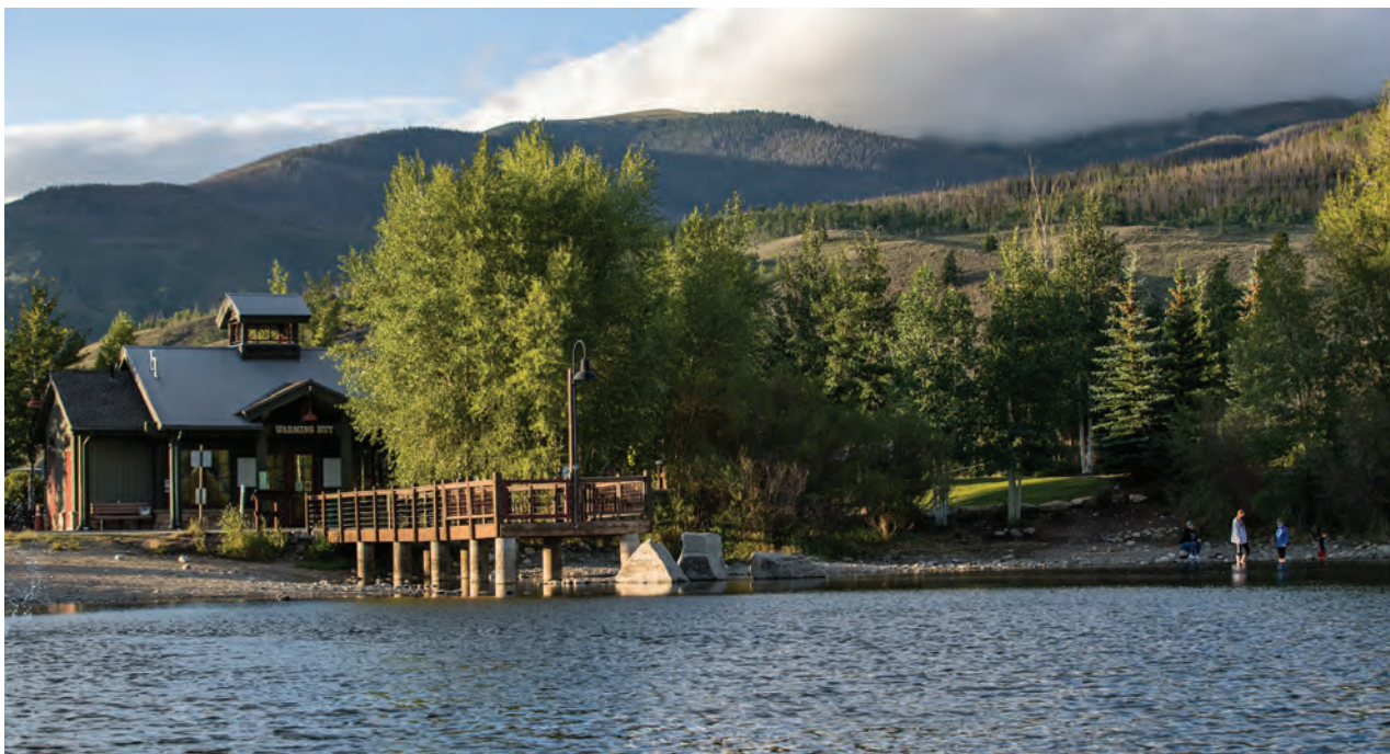
North Pond Park